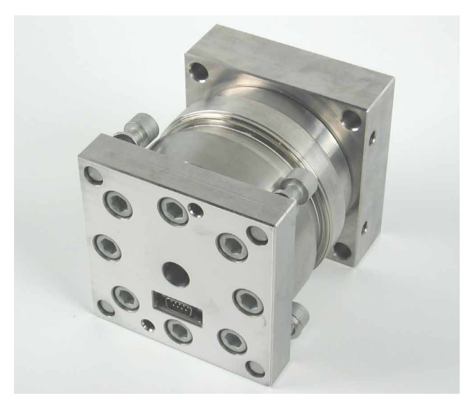
Fig. 1: Back view of crash force measuring element with 9 pin D-Sub connector