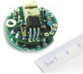
ICA5ATEX ATEX Intrinsically Safe, OEM strain gauge converter, 4-20mA 2 wire