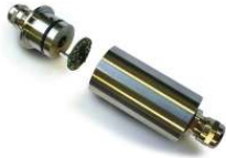
ILE Field enclosure for ICA analogue and DCell data converters