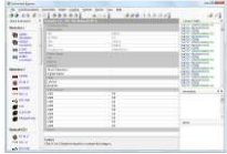
Instrument Explorer Quick set up software event monitoring, data logging, calibration and configuration