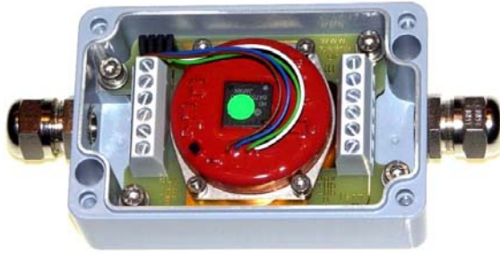
Sensor box containing one NG360 inclinometer with RS485 interface