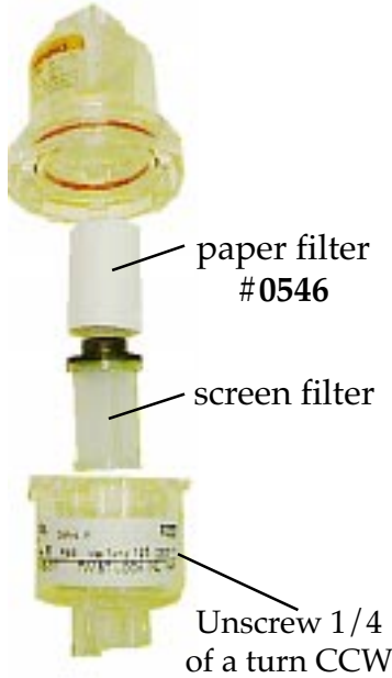
Water Trap Assembly

Water Trap unscrewed 1/4 of a turn counter clockwise when view from sample gas input hose barb